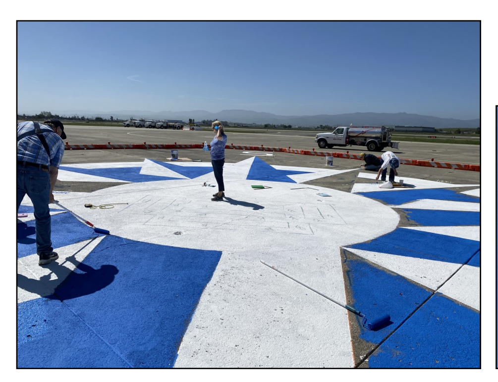
More photos from the air marking