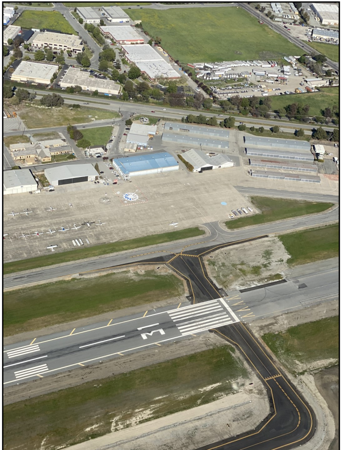
Views from the Glider