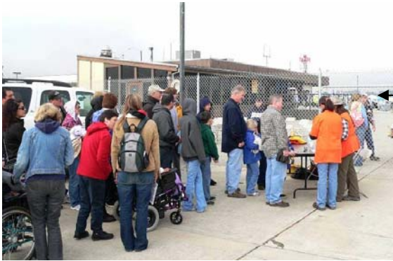
Day In the Sky registrants line up to go fly!