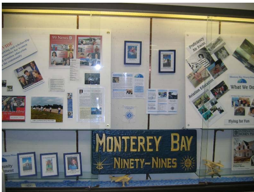
MB99s exhibit at the Aptos Library

Top 5 Mistakes Pilots Make Wednesday Time 7:00 pm - 9:00 pm April 16, 2008 Salinas Community Center 940 N. Main St Salinas, CA 93906