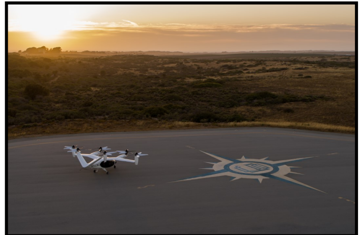
Joby's S4 next to the compass rose we painted at OAR (Marina)