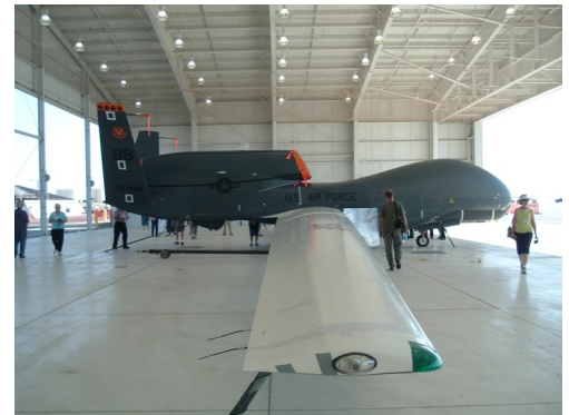
The Global Hawk reconnaissance aircraft in its shelter at Beale Air Force Base, notice its size and the length of the wing.

The Global Hawk tour was particularly fascinating, it is difficult to wrap one's mind around an airplane with a 121 foot wingspan that is totally flown via computer by a pilot sitting in a trailer at Beale Air Force Base. And, they don't use a joystick, it's all computer programs.