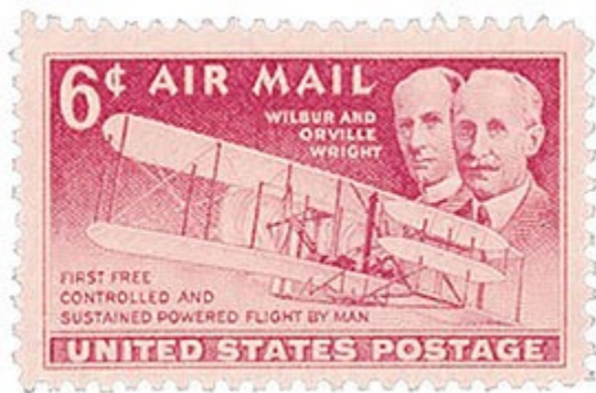
#C45 – 1949 6c Wright Brothers

As we all know, the Wright brothers invented the airplane. Beginning in 1899, the Wright brothers began experimenting with gliders. Their experiments led to their first heavier-than-air powered flight on December 17, 1903 . The event made such a global impact, many different countries honored it on stamps and coins. Today, the Wright brothers are some of the most famous figures in aviation history.