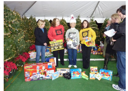
Photo from Monterey Bay participation in the 2010 Share Your Holiday event.

Once again we will have a slot on the air on KSBW to donate aviation-related toys for children. Some of you have been following Laura Barnett's suggestion earlier this year to pick up one toy each month. But, whether you have one toy or 12, join us on the air and show the community just who the Monterey Bay Ninety-Nines are and help make the holidays a little bit happier for local children.