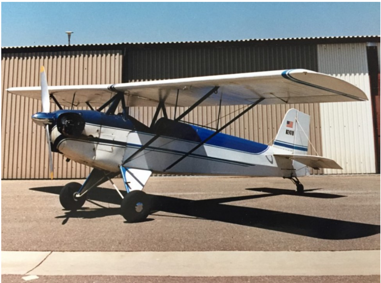
Corbin Baby Ace