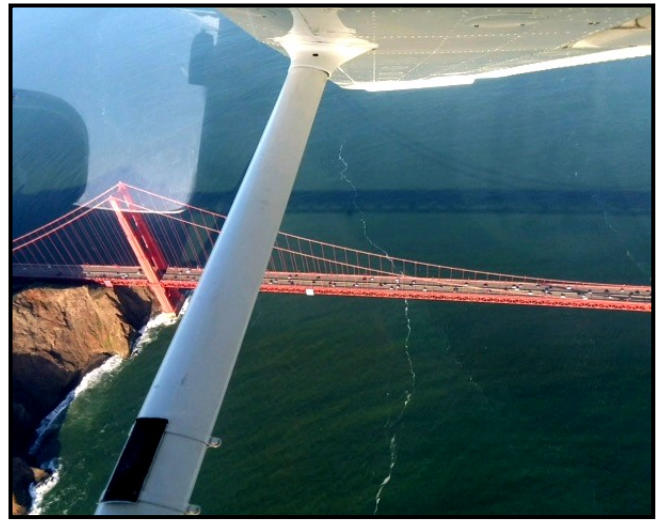
Stopping by Joanne's ranch picking broccoli & feeding Juno the llama...Sophia's flight over Golden Gate