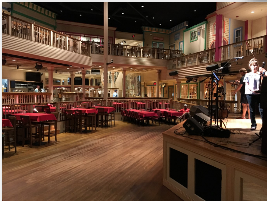
(left) At Buck Owen's Crystal Palace. This place has dining, dancing, music, and museum.