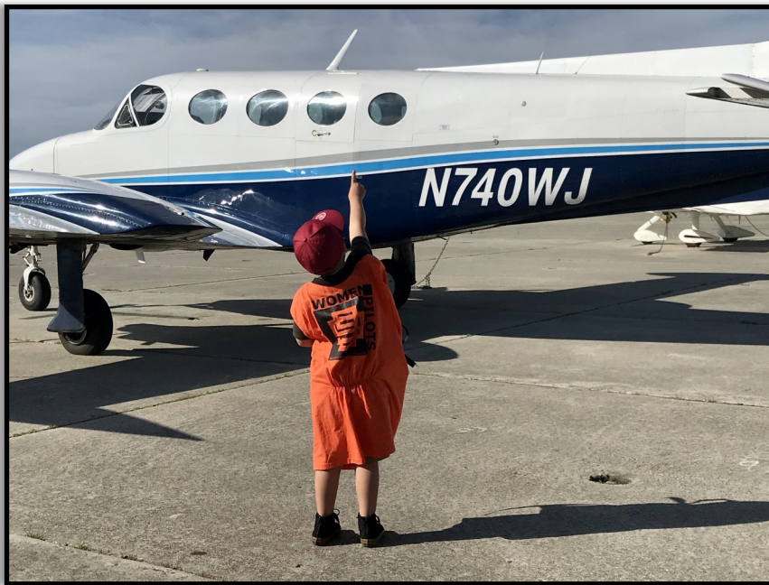
Little wing walker.