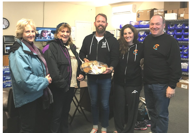
Valentines Day Cookie Delivery to WVI Airport Feb. 14, 2019