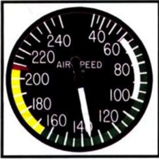
FIGURE 4.—Airspeed Indicator.

How many of us would be able to pass a Private Pilot knowledge exam. Test your skills below and find out. Answers are on the back of the newsletter.