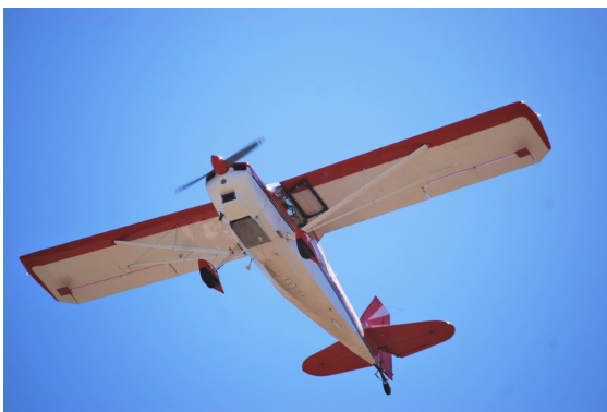
Shumaker Citabria—Sophia doing flour drop with Jeff piloting.