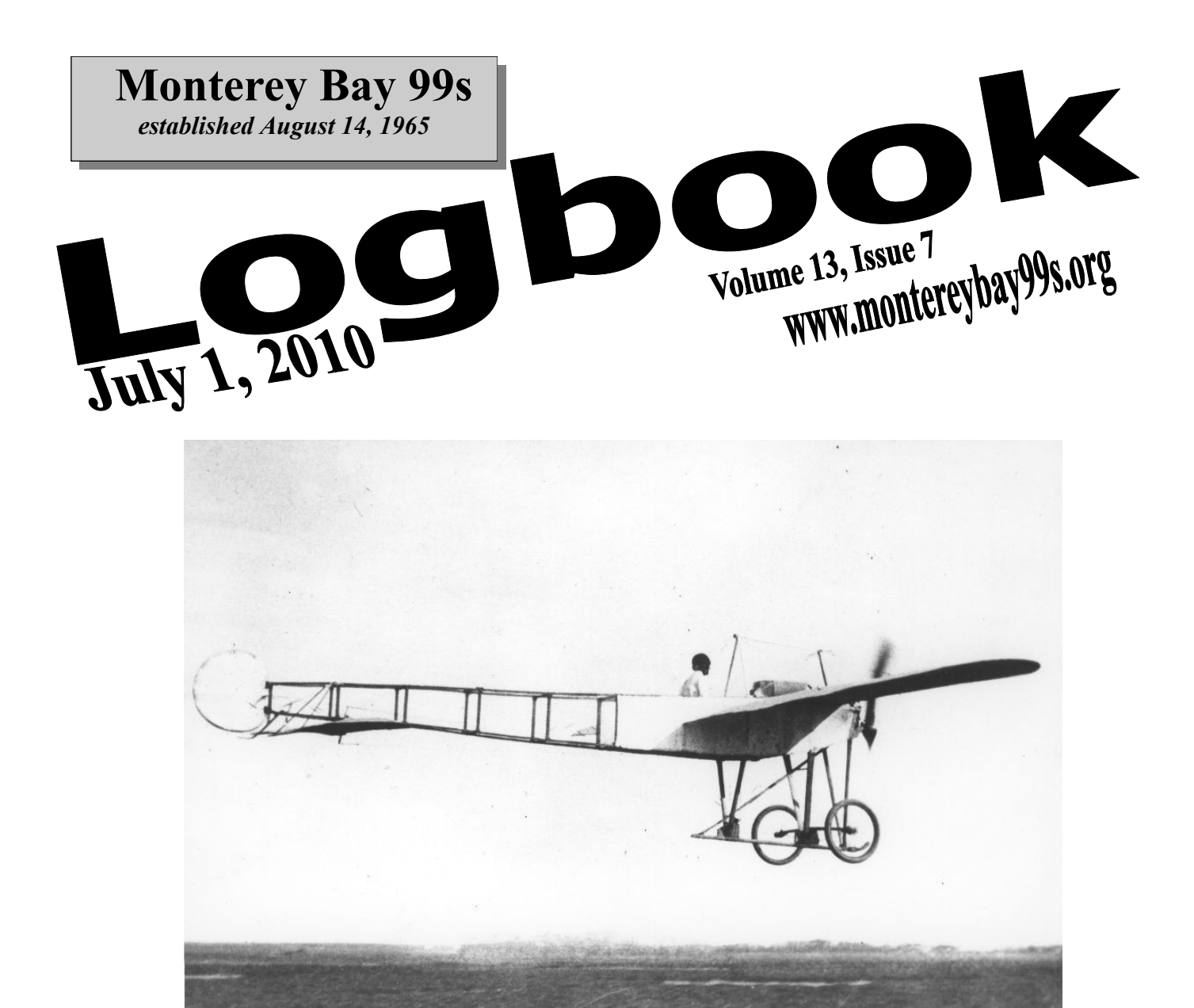
99 years ago: a 1911 Cessna monoplane.