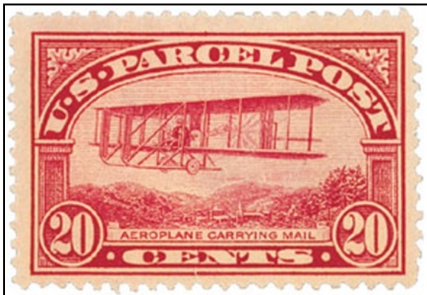
1913 U.S. 20¢ Parcel Post Stamp

In all, 12 Parcel Post stamps (with various pictures) were issued to prepay the fourth-class rate. Their denominations range from 1¢ to $1, featuring mail delivery methods and common ways people made a living. All 12 stamps were red and used the same border design. Below is the only airplane among the 12 stamp