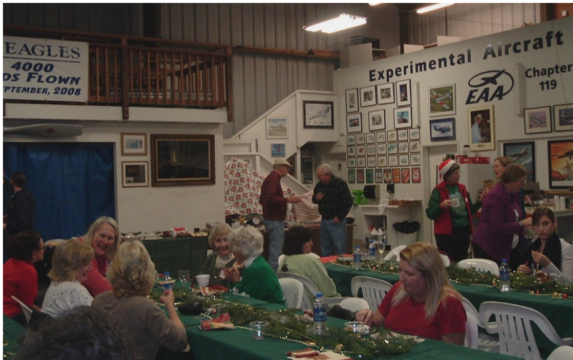
MB99s and guests at the annual holiday party in December.