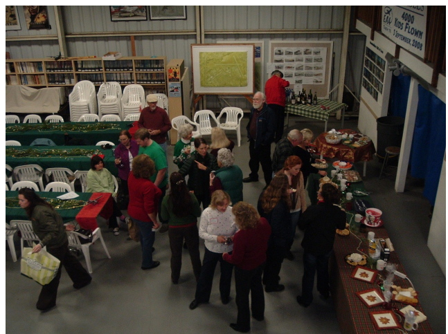
More views of our MB99s Holiday Party last month.