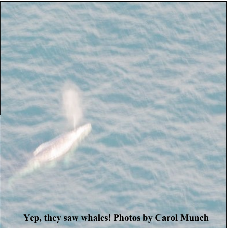
Yep, they saw whales!