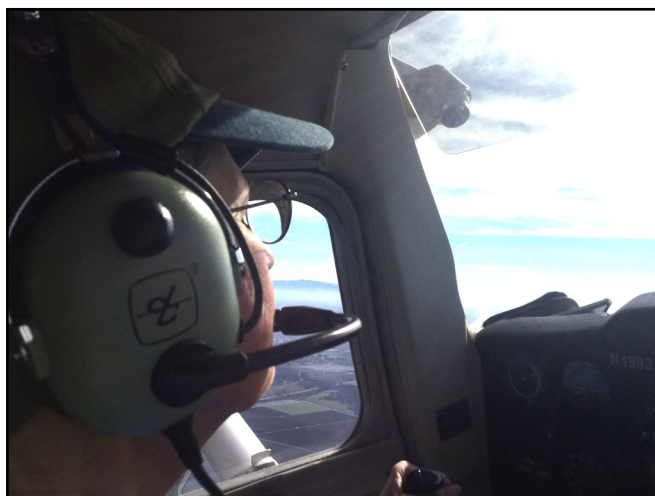
Mona flying over the Pinnacles