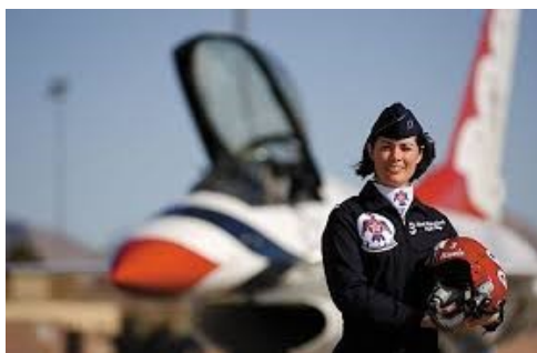
Lt. Col. Nicole Malachowski, the first female Thunderbird Pilot