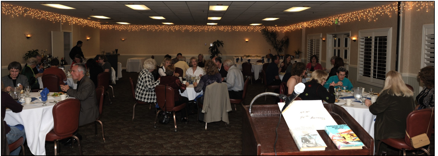
A wonderful gathering, a great meal and good friends share the love of aviation.