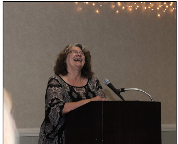
Clearly, we all had a good time!