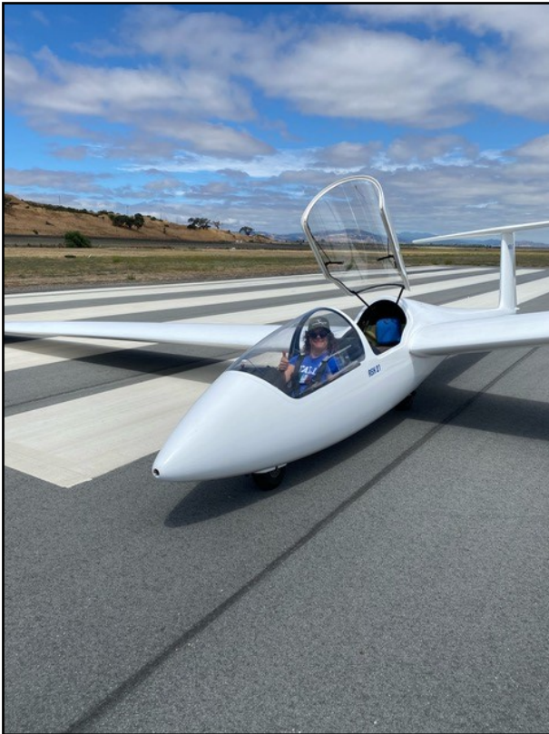
Gabby right before her solo glider ride on July 3 (top)