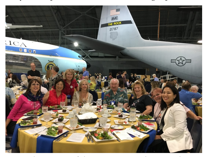
National Museum of the USAF – AEM banquet dinner