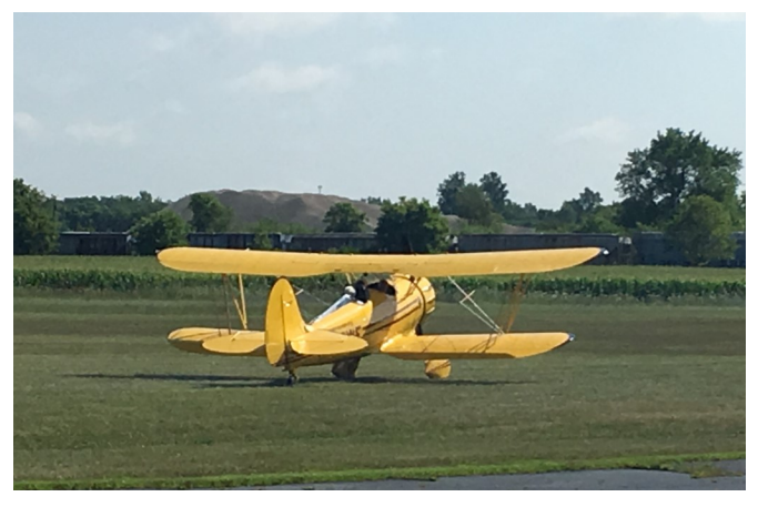
WACO Airplaane Museum \downarrow \uparrow Historic WACO Field . This WACO was giving rides. This museum promoted women in aviation too. See page 6