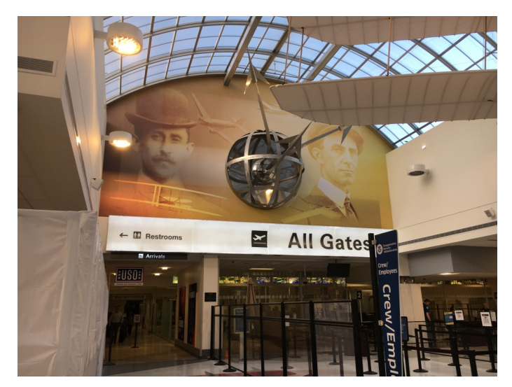
Dayton Airport - Orville & Wilbur Wright picture