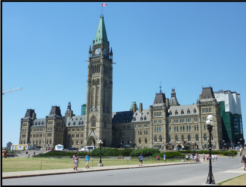
Parliament Hill in Ottawa (capital of Canada)