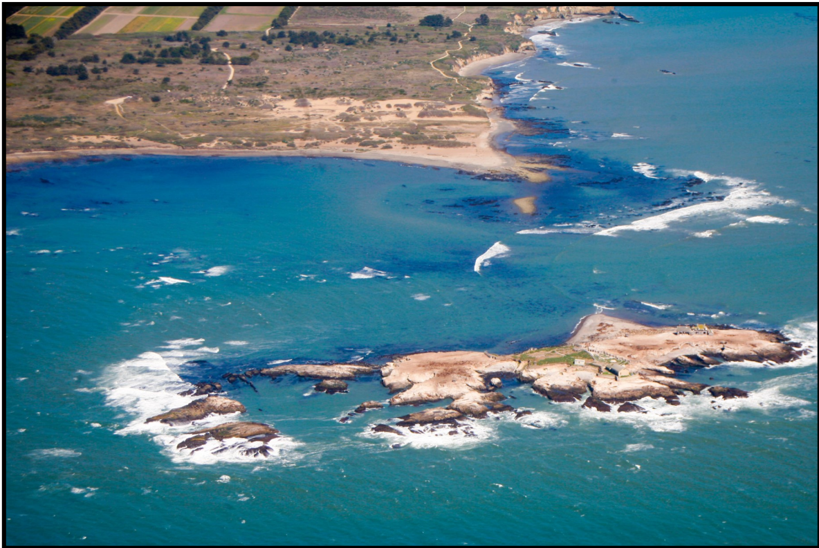
(Mona flew over Ano Nuevo with Alice and Jeanne)

In California, frequent human-caused disturbances to seabirds include low-flying aircraft, close approaches by motorized and non-motorized boats, humans on foot, and general ocean and coastal users. Nesting and migrant seabird populations are significant resources with colonies throughout the state. Over time, these populations have been impacted by a variety of man-made sources, including oil spills, gill-net and other fisheries, various contaminants, habitat destruction, introduced predators, and human disturbance.