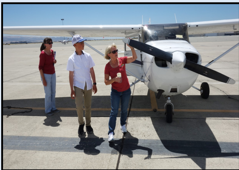
Hawaii flight (bottom)